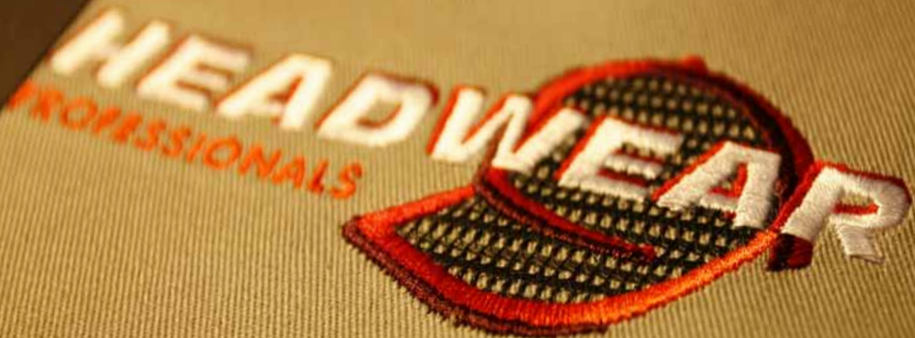
MESH INSERT APPLIQUE