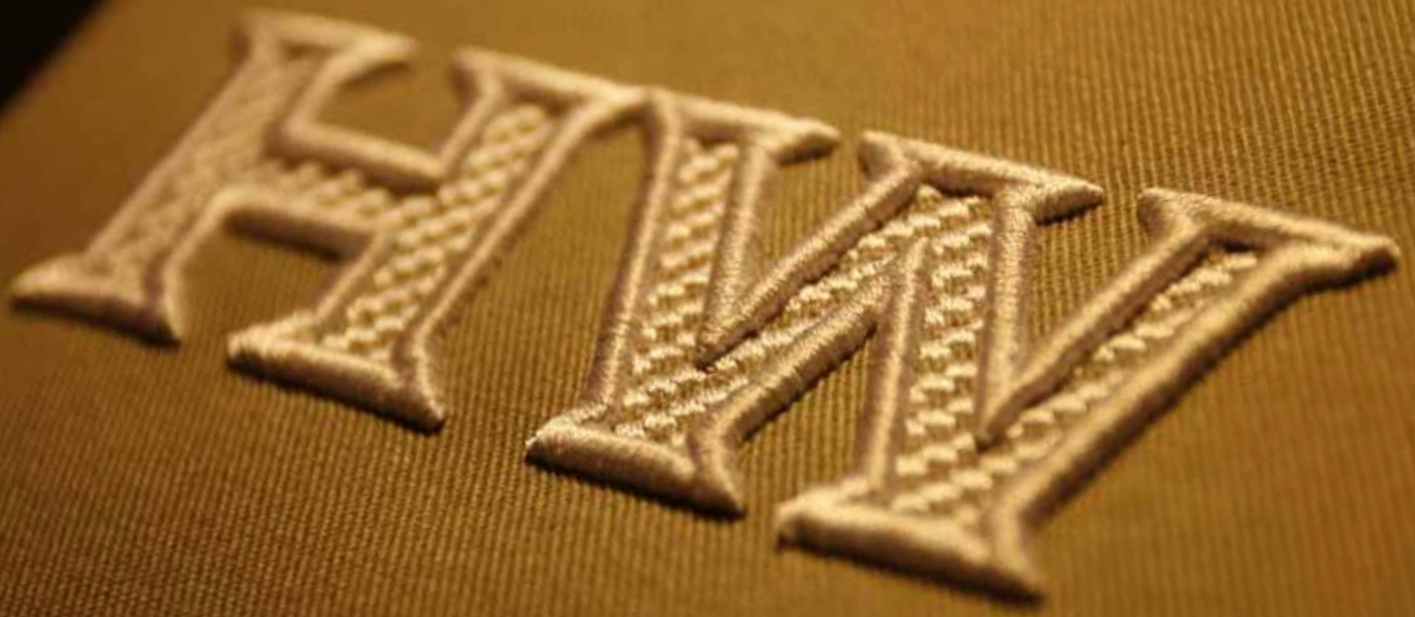
3D KEYLINE EMBROIDERY WITH 2D TEXTURED STITCH INFILL