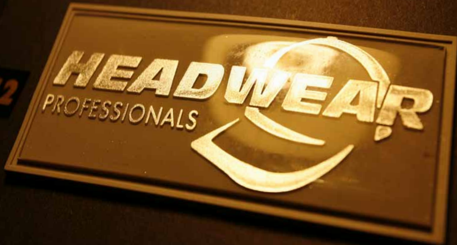
PVC BADGE WITH METALLIC LOGO